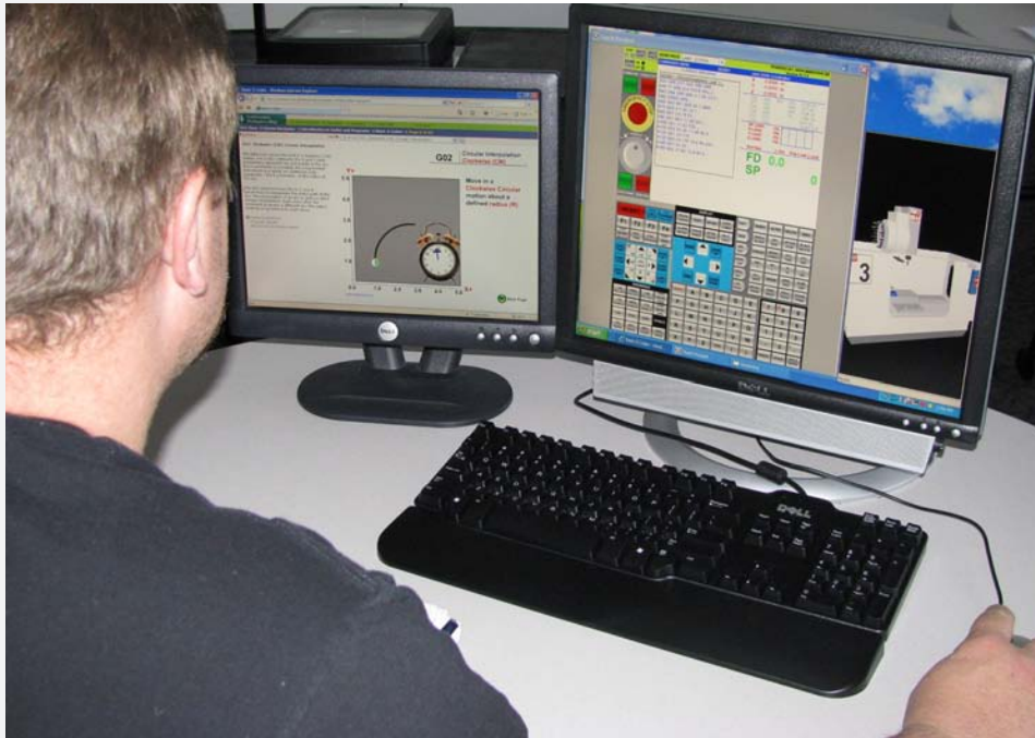
Instructors and students benefit from online interactive learning content, exercises, assessments and virtual CNC panels and 3D machines that run actual M&G code programs.

Students Access Virtual Machining Centers Online 24/7, Before Advancing to the Real Deal!